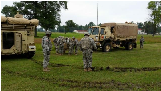
Figure 1-1, Elements of HHT completing break down of CTCP at Fort McCoy, WI

The squadron's ability to conduct sustained reconnaissance and security operations was heavily reliant on the ability for the tactical logistics execution to adequately support the maneuver plan.