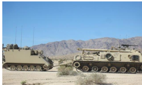
Figure 1-4, M88 Conducting recovery operations during NTC rotation 15-06

While it was a challenge (RECON) ahead of CTCP, it was not elements of the CTCP responsibilities, the focus on security and CTCP during there were instances taken and security was intelligence) to allow