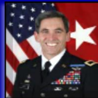
BG (R) Wolf AV 11 th AV BDE