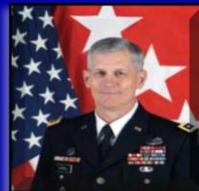
LTG (R) Campbell AR CG, III Corps