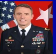
BG (R) Lehr IN CG, JTF North