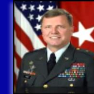
BG (R) Weber AR DCG(S) 3 ID