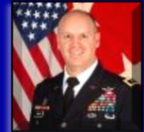
MG (R) Golden AV DCG (O) 8 Army