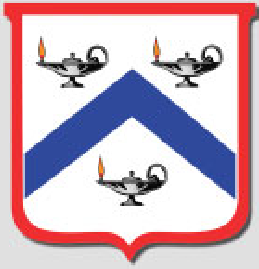
United States Combined Arms Center and Fort Leavenworth