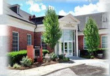
The Frontier Conference Center