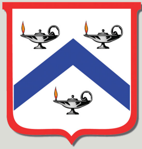
U.S. Army Combined Arms Center and Fort Leavenworth