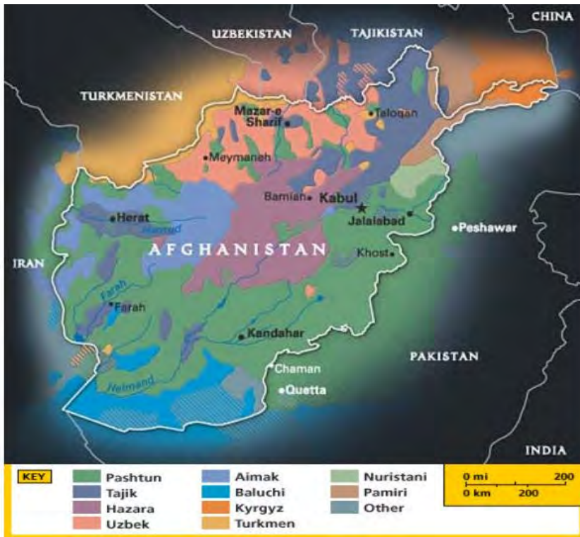
Figure 1. Central Asia Languages