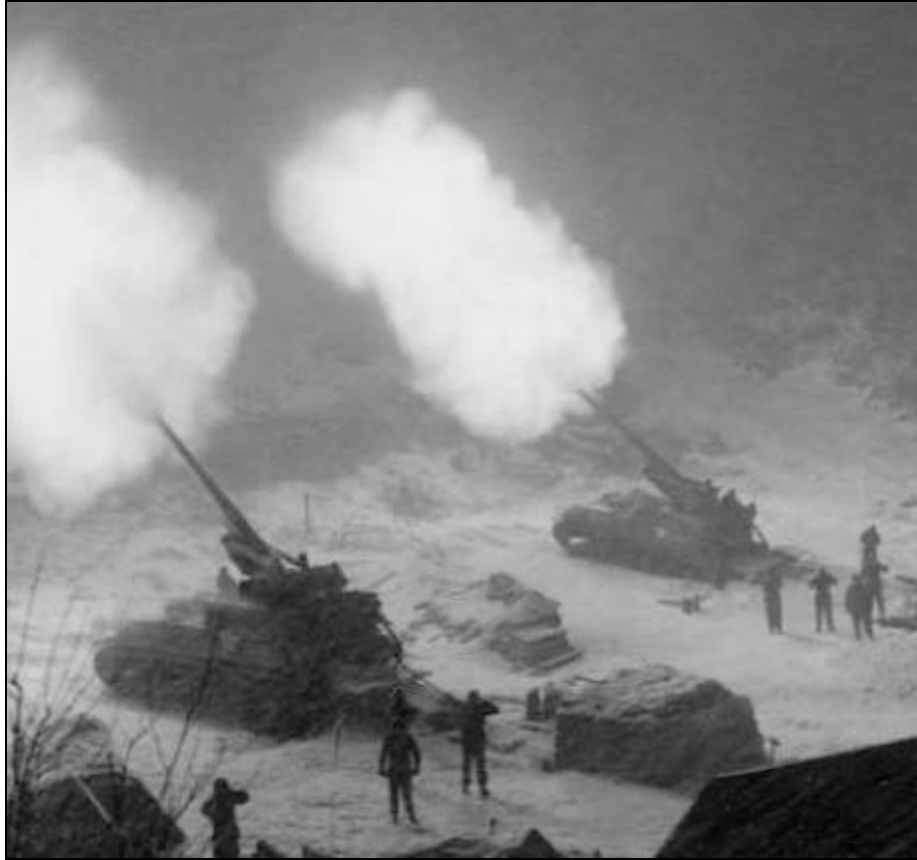
“Long Tom” 155mm self-propelled guns fire in support of the 25th Infantry Division near Munema on the west central front. (U.S. Army, 26 Nov 51)

effort. 75 By fall 1952, the Eighth Army had 36 155mm howitzers plus 44 8-inch guns after a battalion of 105s converted to the 8-inch. Unfortunately the 155s in particular were plagued by ammunition shortages. 76 While defensive fires never failed to be fully employed, useful limited operations that would have saved lives in the long run, such as a planned attack in the Triangle Hill complex by the South Korean 2d Division, had to be canceled. 77 However, since an adequate supply of 438 lb, 240mm rounds existed in Army stocks, two battalions were switched away from the 155mm and given the massive 240mm howitzers in May 1953. 78