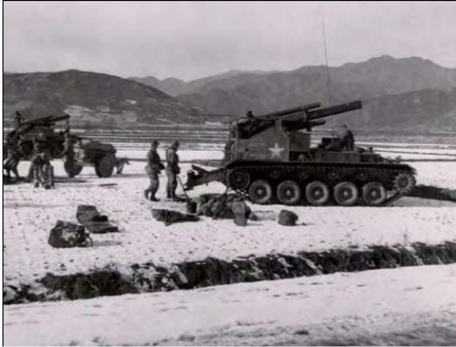
7th Infantry Division 155mm self-propelled howitzers near Sinhung protect the perimeter around the seaport city of Hamhung during the withdrawal of the 1 st Marine Division from the Chosin Reservoir. (U.S. Army, 2 Dec 50)

105mm howitzers fell into Chinese hands with little or no damage and were not destroyed by subsequent air strikes. The North Koreans had little interest in the American-made artillery when they overran much of the South the previous summer because their Army was a totally Soviet-equipped and supplied force. 47 However, the mainstays of Chinese field artillery in 1950 were Japanese 75mm field guns and 105mm howitzers and guns, Soviet 76mm guns, and the “made in USA” 105mm. 48 For obvious reasons, the Chinese were more than happy to add the captured weapons to their inventory.