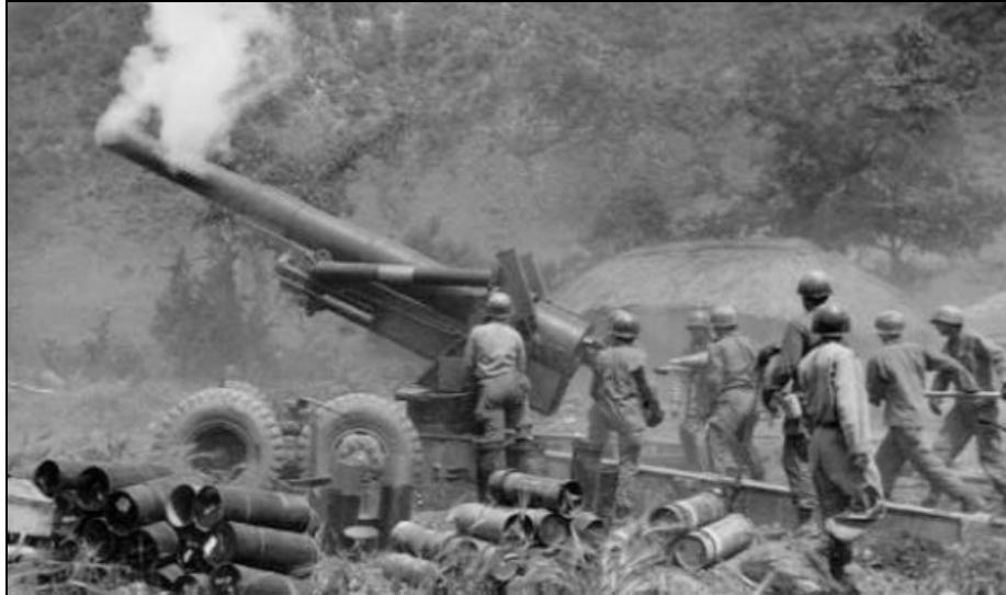
Eighth Army cannoneers reloading their 8-inch howitzer during a fire mission against Chinese targets.

recover five of them. 61 This episode saw the last U.S. field artillery lost to enemy action during the war.